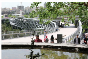
Tabiat Pedestrian Bridge Tehran, Iran