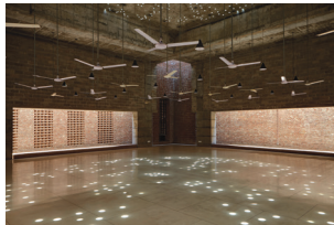
Bait ur Rouf Mosque Dhaka, Bangladesh