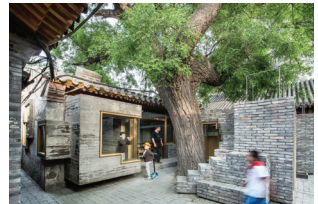
Micro Yuan'er Children's Library and Art Centre Beijing, China