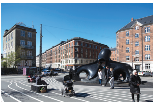
Superkilen Copenhagen, Denmark