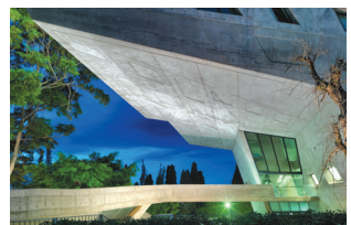
Issam Fares Institute Beirut, Lebanon