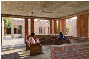
Friendship Centre Gaibandha, Bangladesh

The recipients of the thirteenth cycle Aga Khan Award for Architecture including architects, clients and craftsmen received awards from His Highness the Aga Khan and His Highness Sheikh Mohammad bin Rashid Al Maktoum, Vice-President and Prime Minister of the UAE and Ruler of Dubai, during a ceremony held at the Jahili Fort in Al Ain, UAE, on the 6 November 2016.